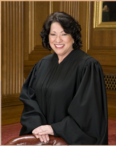
Justice Sonia Sotomayor