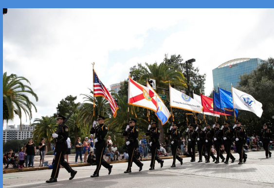
Orlando Veterans Day Parade

On November 11th, we honor and recognize those who have served our nation in the armed forces through parades, school assemblies, and other national events. These men and women have, in the words of the Oath of Enlistment , volunteered to defend the Constitution of the United States against all enemies, foreign and domestic, bearing full faith and allegiance to that founding document. They serve as role models of civic participation, fulfilling one of the most important responsibilities of citizenship.