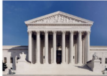
U.S. Supreme Court