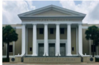
Florida Supreme Court