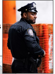
A police officer

What do a governor, a nurse, and a teacher all have in common? They are all public servants. Public servants are people who all work to benefit the public. Public service refers to the work and activities that focus on people’s needs and the importance of the public good. Some examples of public servants would be those who work in healthcare, education, law enforcement, military, government officials, or transportation. Public service is important for so many reasons! These individuals work hard to keep our community safe, provide basic needs for the community, and address community problems as quickly as possible. Our government wouldn’t be able to function ( work ) without the selfless work of public servants and the services they provide.