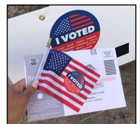
Voting sticker and ballot

Voting is another crucial ( important ) way for citizens to get involved. When people vote, they are sharing their point of view and ensuring that their voice is heard. Voting in elections is very important because people choose the individuals they want to represent them in the government. In the United States, you need to be at least 18 and registered if you would like to vote. During elections, citizens cast their ballots to vote for local, state, and national officials. Many people have fought for the right to vote over the years. And now, because every eligible person gets one vote, the act of voting is one of the truest forms of people being equal.