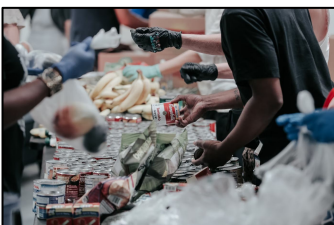
Volunteers giving out food

There are many different places where someone can volunteer to help. You could volunteer at home, in