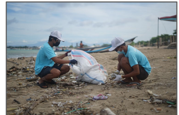
People cleaning up litter on a beach

Have you ever picked up trash in a park? Or have you ever asked your parents what you can do to help around the house? If you have, you have volunteered your time or services. When you volunteer, you are offering up your time or your services to help out without the expectation of getting paid. Volunteerism is an important civic virtue. Volunteerism keeps our community running smoothly by keeping its citizens safe and well cared for.