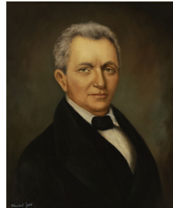
William Pope Duval