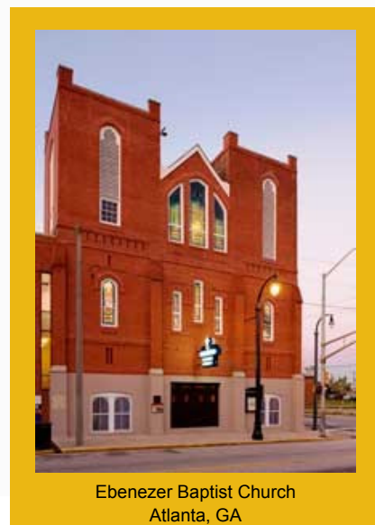
Ebenezer Baptist Church Atlanta, GA

To many, Dr. King was the "Drum Major" of the Civil Rights Movement, but that is not how he saw himself. He never "desired to be out front or to lead the parade." He did what he did because it was the right thing to do, and said that if he were to be remembered as a drum major, let it be for justice, peace, and righteousness.